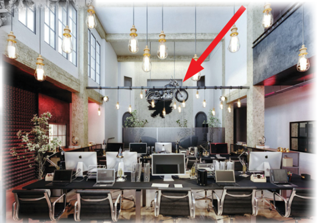
The Salty Commune with motorcycle centrepiece