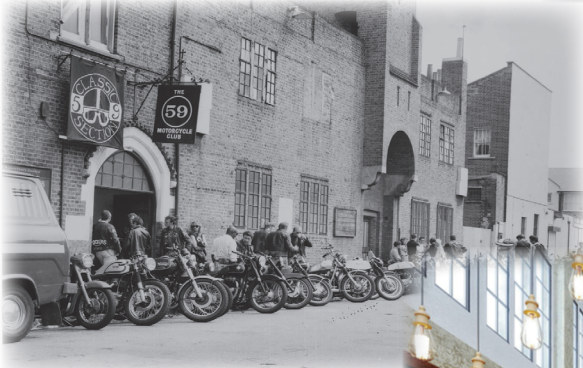
The '59 Club, Hackney, London