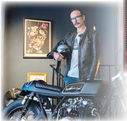
The Buster and Punch 'Boneshaker Black'