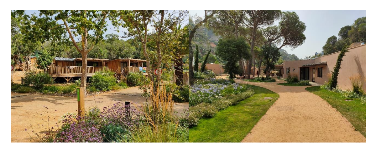
Bungalows and Supermarket – Restaurant-Breakfast