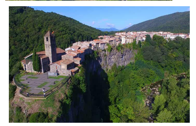
Castellfollit de la Roca, built on a geological rampart between 2 rivers.

Should you be interested in volcanos. Olot is placed between them!