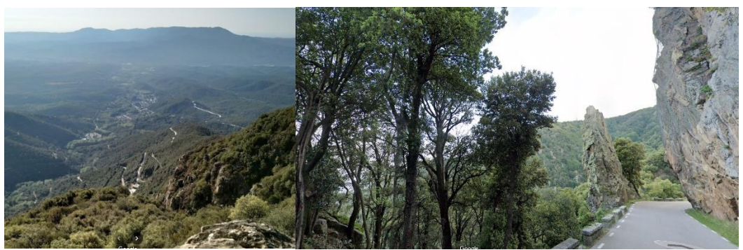
On your way back you might stop at Hostalric, medieval village, for a break.