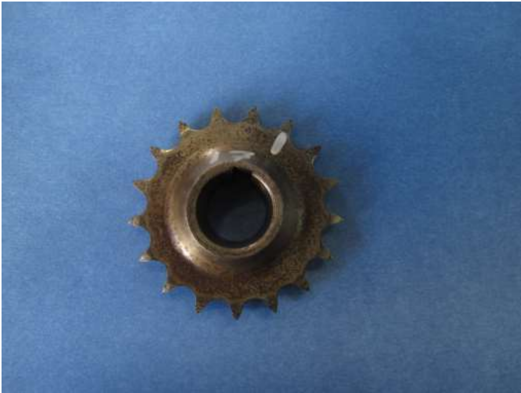
Figure one. Engine sprocket, crankcase side view, 17 teeth.

Norton Model 50, Slimline frame, 1961 engine sprocket details.